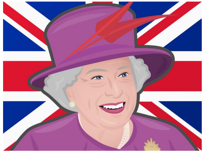
Remembering Queen Elizabeth II – 1926 – 2022

Church Centre, 253 Rodney Street, Wellsford 0900